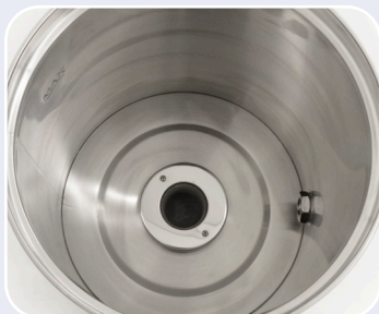
Stainless Steel Interior