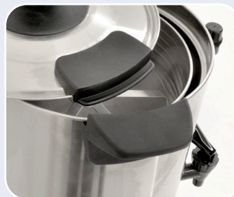
Locking Lid and Handles