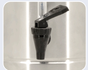
Non-Drip Water Faucet